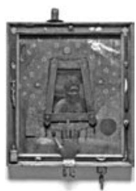
Betye Saar's Beyond Midnight